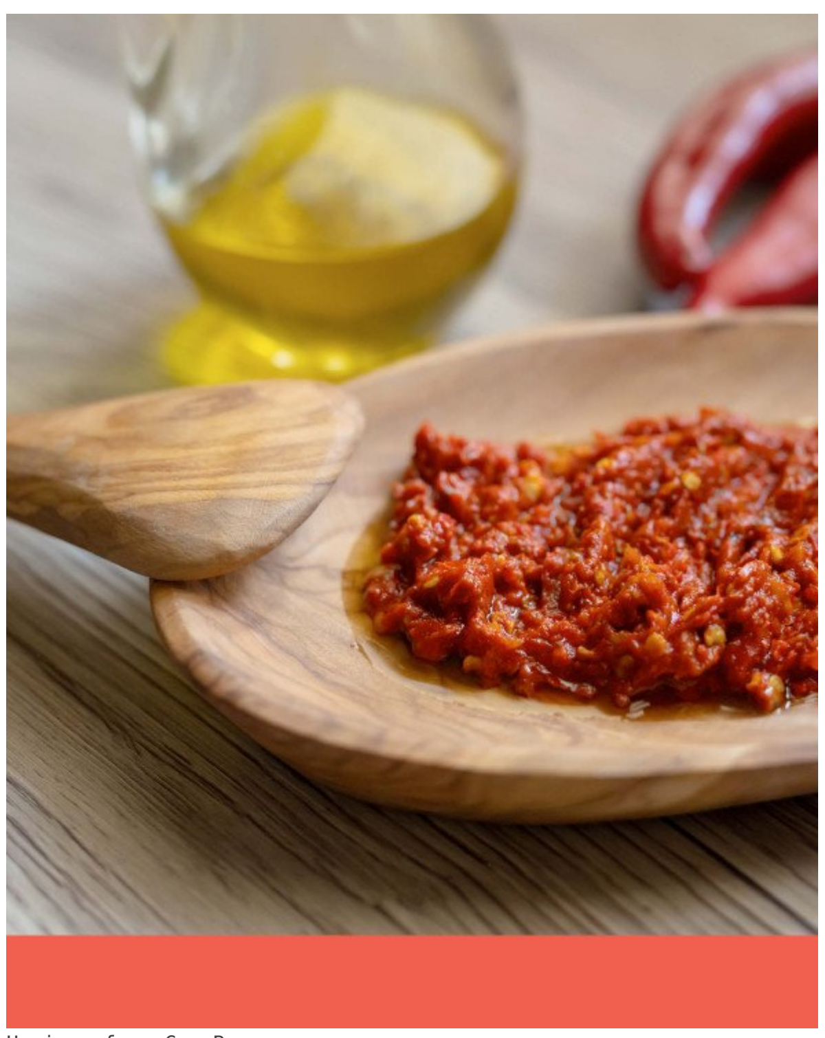
Harissa from Cap Bon