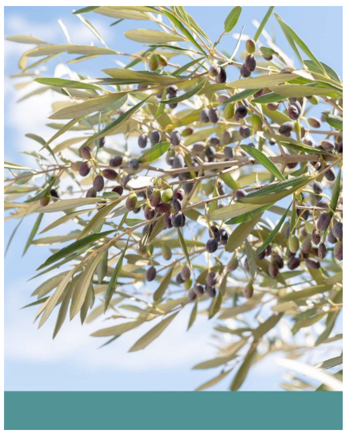
Center and Dahar olive oil