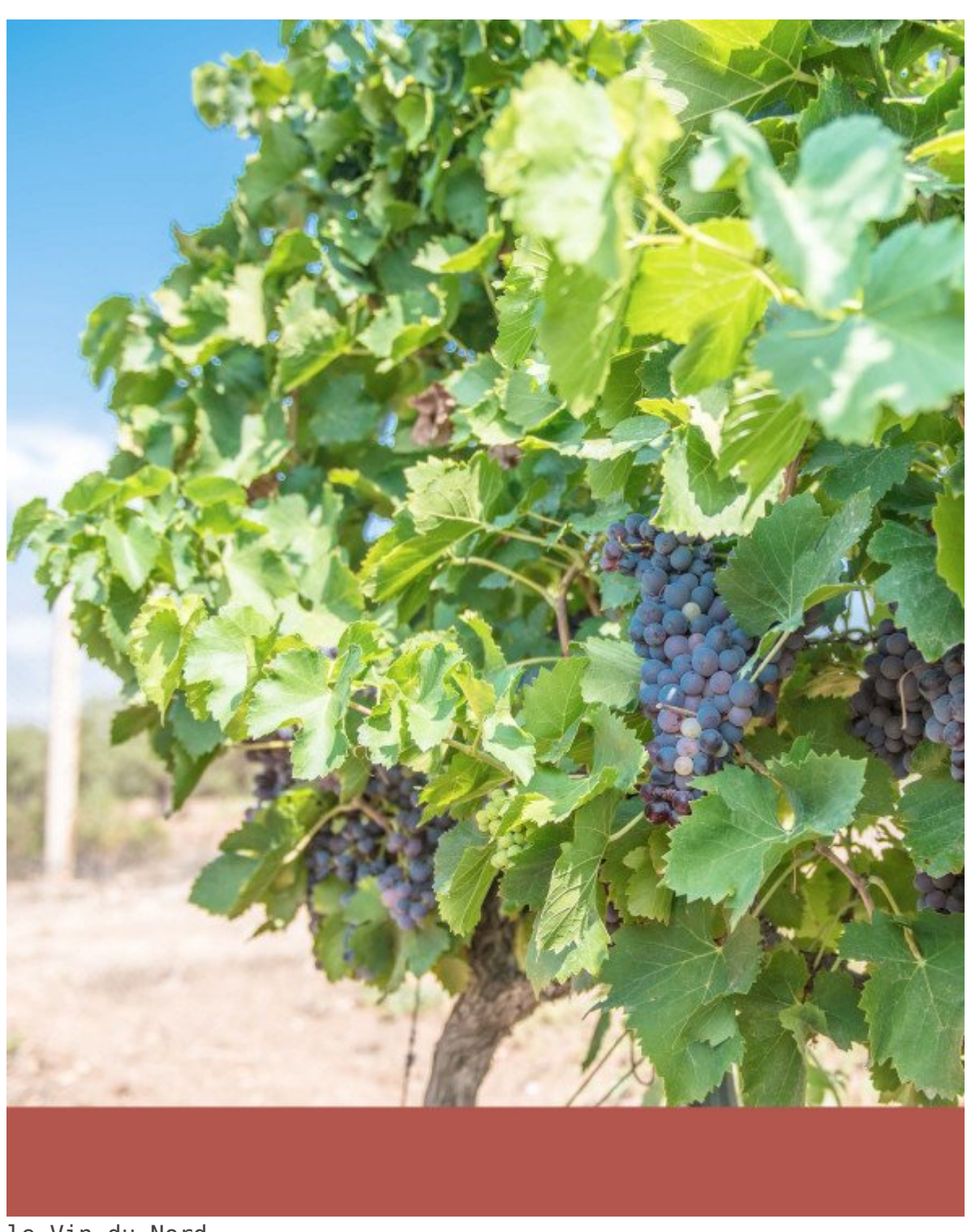
le Vin du Nord